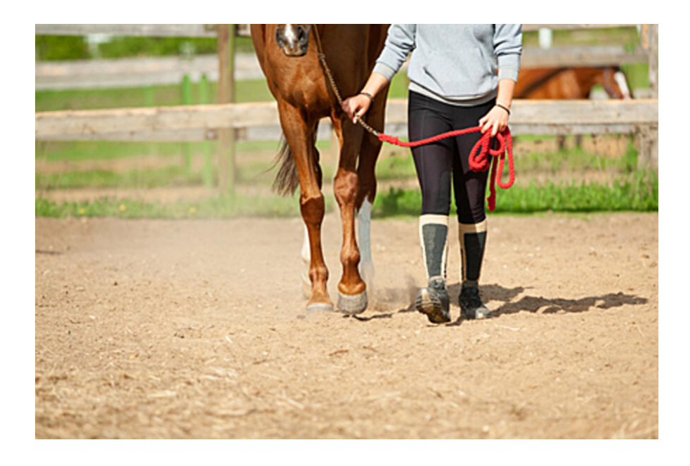
Looking For Community?